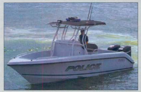
Craft shown with optional equipr